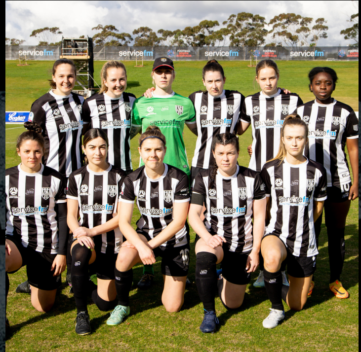
Adelaide City 2022 WNPL & WSL Cup Final

"Even this year, not that we got lucky, but it's a battle. Every time we play them you can't pick who is going to win.