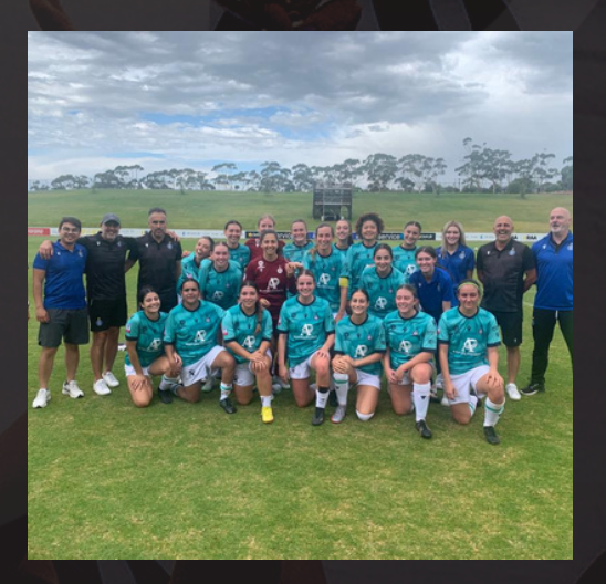
Salisbury Inter celebrating the Pre Season Cup

"We are not going into this game thinking that we have no chance; there is definitely belief that we can beat them, but also, we are very well aware that they've got quality running through that whole team."